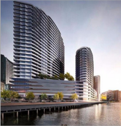
889 Collins Street

To view our entire portfolio visit fmv.com.au/our-portfolio